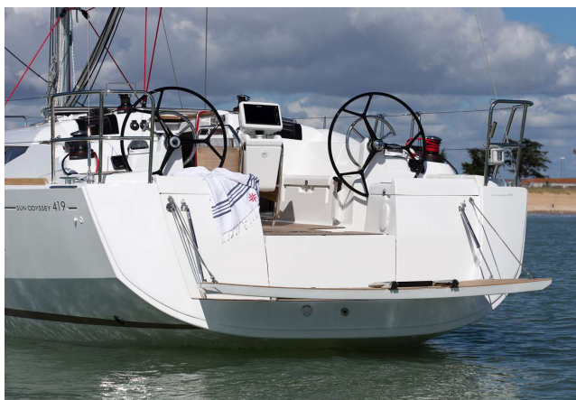
JEANNEAU SUN ODYSSEY 419