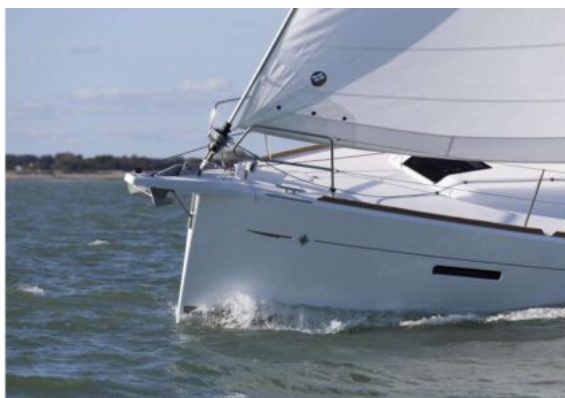
JEANNEAU SUN ODYSSEY 419