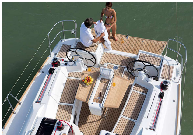
JEANNEAU SUN ODYSSEY 419