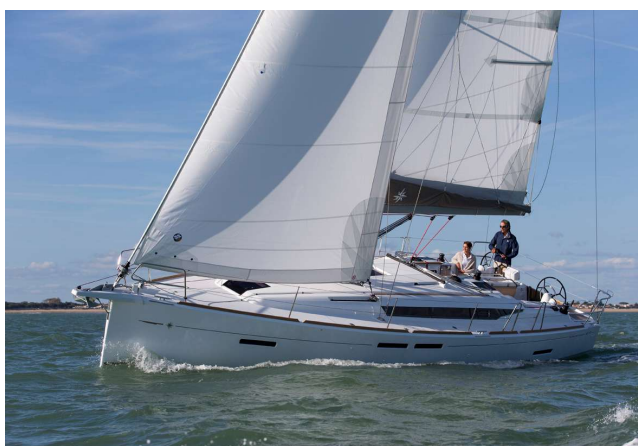
JEANNEAU SUN ODYSSEY 419