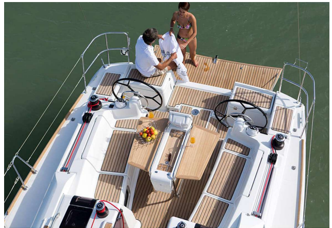
JEANNEAU SUN ODYSSEY 419