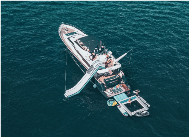
GUY COUACH 100 "LADY AMANDA"