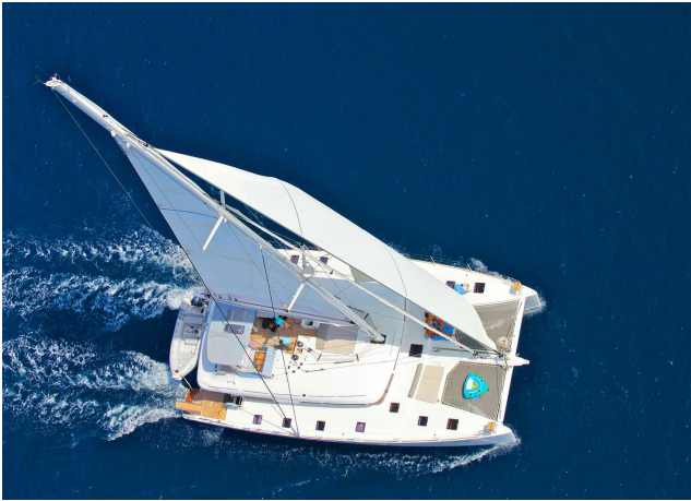
LAGOON 620 "NOVA"