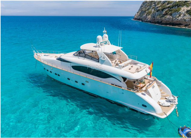
MAIORA 24S "LEX"