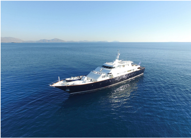
PICCIOTTI 140 "LIBRA Y"